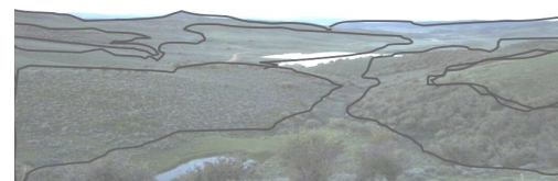
Figure 5. Rangeland Depicting Different Types of Land Based on Visual Clues in Aspect, Topography and Vegetation.

In the field it is often possible to identify different types of land just by looking at variations in vegetation and site characteristics (Figure 5). This gives you a general sense of the types of land, but in order to identify the ecological site of interest, it is necessary to gather a few additional resources. You will need to consider the topography, soils and plants on a site (see Box 3). Since different ecological sites have different characteristics and potentials, it is important to follow these steps in order to make sure that you correctly identify the ecological site of interest.