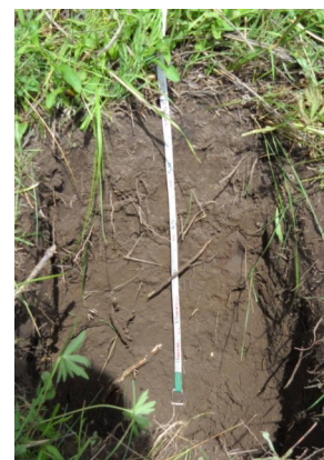
Figure 3. Mountain Loam Ecological Site