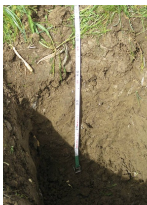
Figure 2. Claypan Ecological Site

A state and transition model (STM) is a diagram that depicts our current understanding of ecological dynamics on an ecological site. An STM identifies the different plant associations or “states” that may exist on a given ecological site and how other site characteristics, such as hydrology and soil stability, might change with them. STMs describe the environmental conditions, disturbances and management actions that cause vegetation to change from one group of plant species to a different set of species, and the management actions needed to restore plant communities to a desired composition. STMs help you identify where the land is currently (its present state) and what potential alternative states it could inhabit, and provide ideas about how to move to a more desirable state and avoid unwanted transitions.